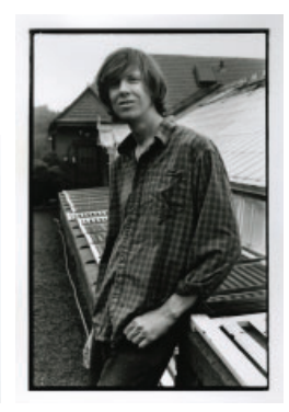
Bottle of Smoke Press New York